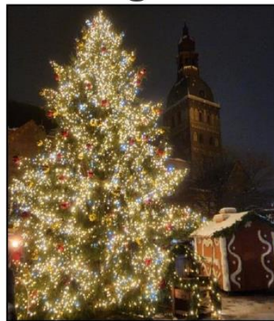
The Christmas market on Dom Square Riga, Latvia

Because of the international crises caused by the Ukrainian conflict, we left Russia in March. As we prepared to leave, we were faced with decisions of what to take or leave. How long will we be gone? Or will we leave permanently? We weighed these decisions in a day and a half to decide as we packed two suitcases each to leave. We didn't know then that our choices would carry us during six months of a semi-nomadic life.