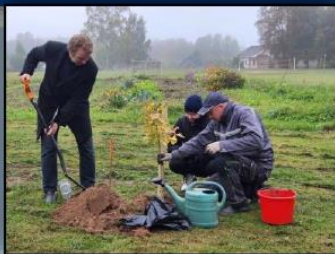
An oak tree is planted by members of Bārbele Evangelical Lutheran Church, Latvia