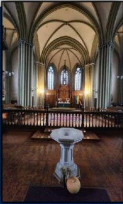
St. Gertrude Old Lutheran Church. Riga, Latvia